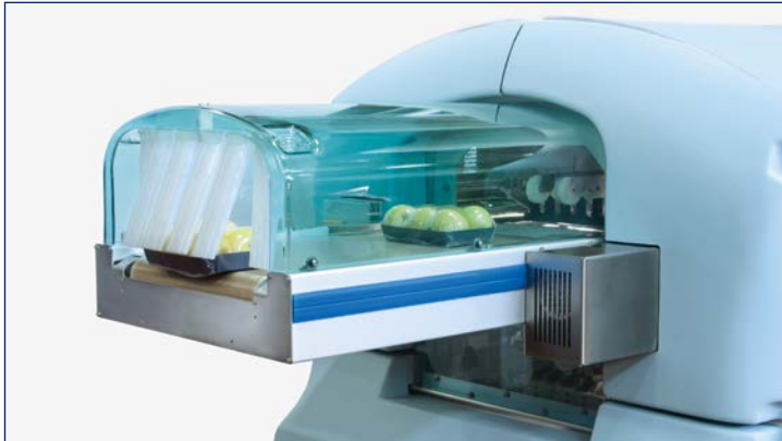
Heated sealing belt and outfeed conveyor.