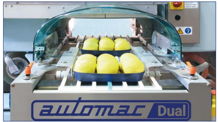
Compatible with all kinds of trays and films, including compostable ones.