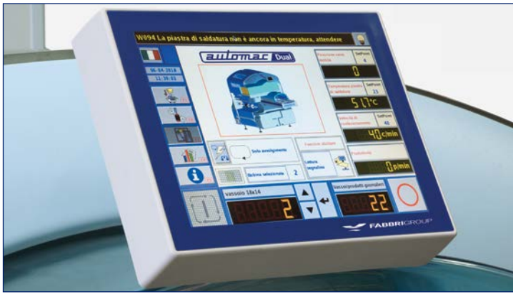
New touch-screen monitor, up to 50 editable programmes.