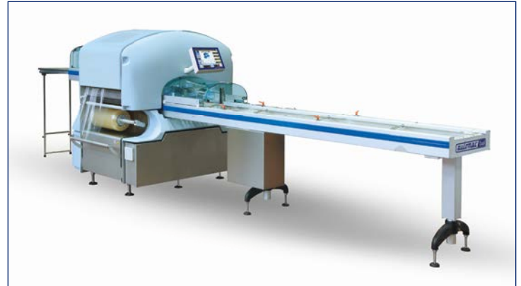
Various optional devices for maximum line integration.